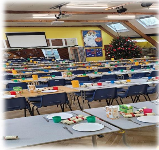
Our hall set up for Christmas lunch

Over the two days, the kitchen has served approximately 370 Christmas meals to the children and staff! We would like to say a big 'Thank you' to them for carrying out this huge task!